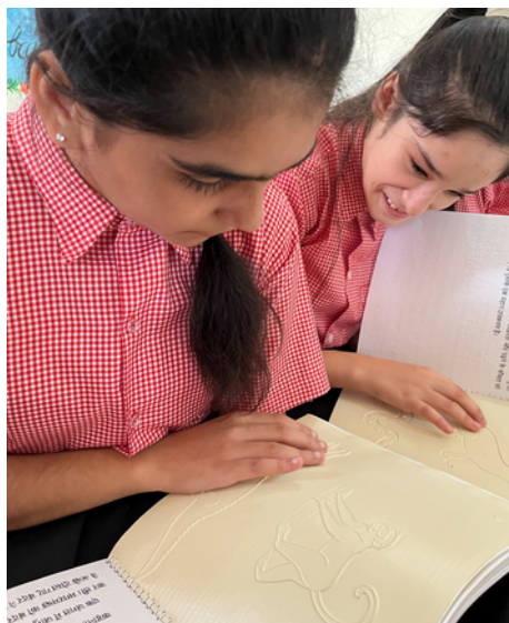
Students exploring the books during the workshop