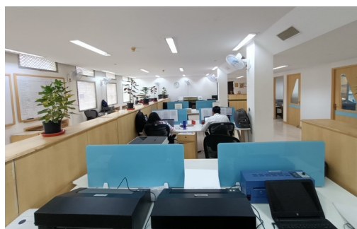
Our new office space

We have shifted our office and production facility from Sonipat, Haryana to a bigger and better space in Sector 59, Noida, Uttar Pradesh. We are grateful for the support of our donors, users, well-wishers for being able to expand. We are hopeful this new shift will help us empower more visually challenged children. Our contact numbers remain the same. New address : B-15, Sector-59, Noida, Gautam Buddha Nagar, Uttar Pradesh 201307