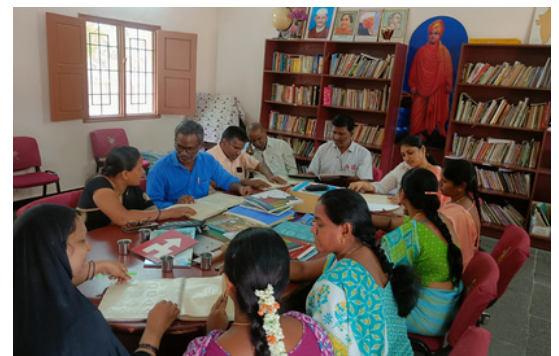
Training session at RDT, Anantapur

"My team of teachers have been using the kits, and getting geometry constructions done by our students, so they were able to help the visually impaired teachers and trainers from other organizations. It was actually a 'Wow' experience for all of us. They were excited doing constructions by themselves. Thanks for joining online and taking sessions that were as good as live sessions" said the head of Manav Kalyan Trust, Gujarat.